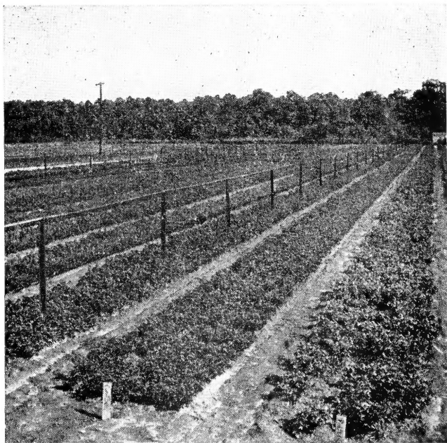
This is how our Azaleas look. Visit us and see our fine stock.

CORAL BELLS - Hose-in-hose deep pink. The favorite pink Azalea 6-8 in. to 10-12 in.